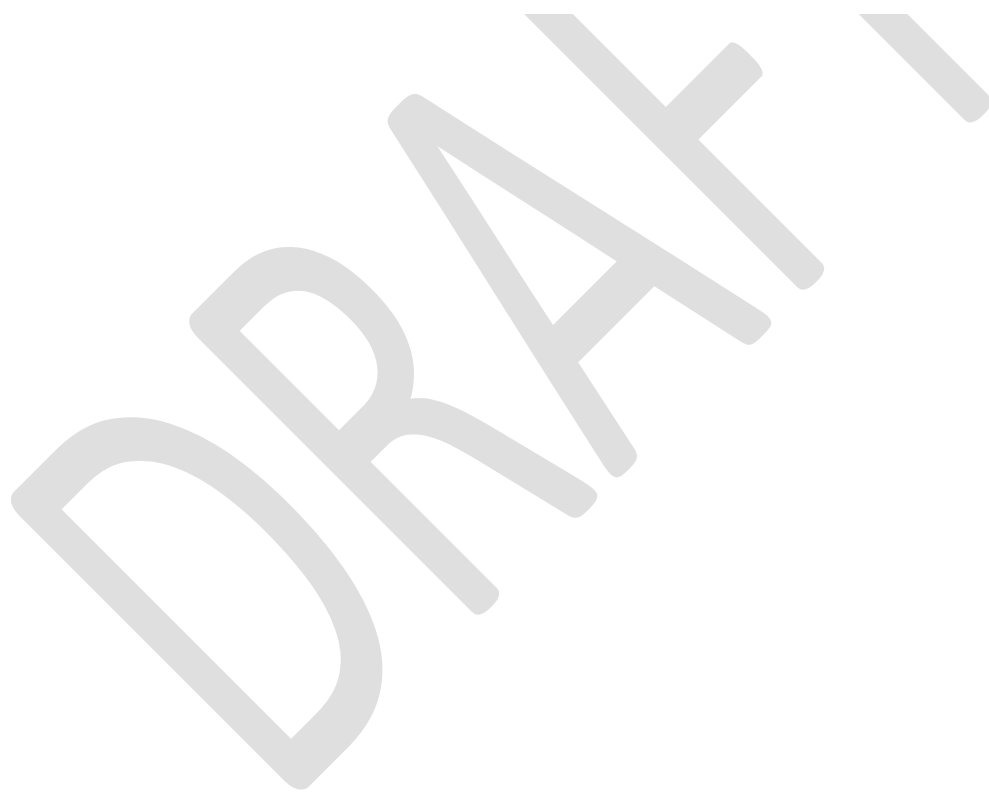
Table of Contents Printable Version Save